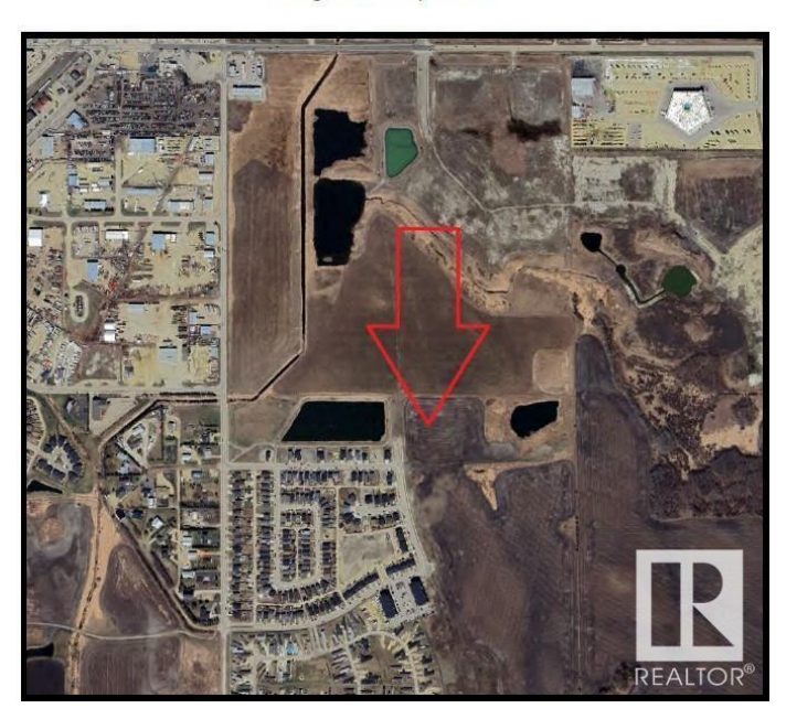
Google Earth - April 2023

The subject property is the fee simple interest of a +/- 3.40 acre proposed potion of the SW 20-4â€"26-W4M, in the city of Lacombe. Access to this area is good via municipal roadways off nearby thoroughfares. The developments immediately sounding the subject property consists of other residential properties, mainly single family, and multi-family developments. The Wes Jackson industrial park is located northwest of the Mackenzie Ranch neighbourhood and Lacombe Market Square and adjacent lands located north of McKenzie Ranch are planned to future commercial and residential development. Homestead Road running along the parcels western boundary has been constructed to the City of Lacombes required standards. Seller noted that all off sites levies have been paid, Urban municipal services â€" water, sewer, natural gas, electricity, telephone/cable are available at or adjacent to the subject property parcel boundary.